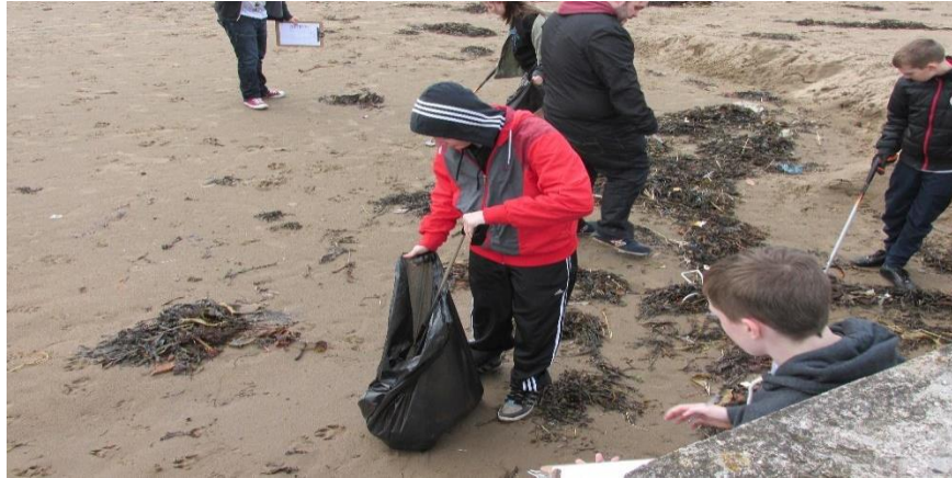
Photo: Pupils litter picking at local beach

Parentzone Scotland | Parent Zone (education.gov.scot)